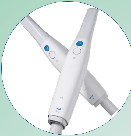
INTRAORAL SCANNERS PRICED TO CLEAR

EX-DEMO AND NEW EXCESS STOCK LINES MUST GO