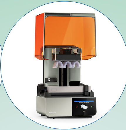
3D PRINTERS HEAVILY DISCOUNTED