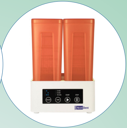
WASH UNITS - RESERVES FROM $767